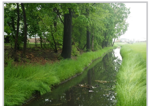
Coles Brook and surrounding wetlands restored to their natural state. The remainder of this commercial property (not pictured) is now back in productive use by its owner.