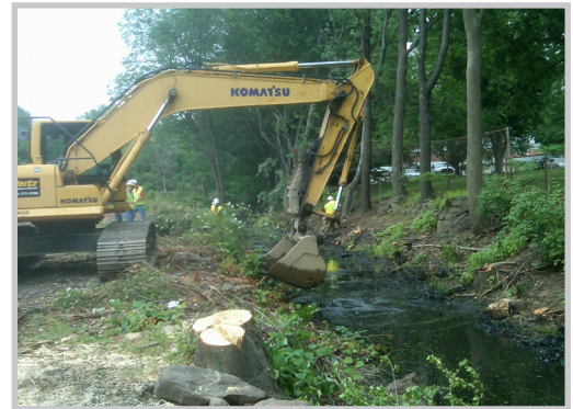
Preparing Coles Brook for installation of a temporary culvert pipe. The pipe was used to reroute Coles Brook to prevent water flowing into soil excavations.

The total volume of contaminated soil excavated at all Recovery Act-funded locations at the Maywood Site was 44,525, or enough to fill about 660 gondola-type rail cars used for transporting bulk materials such as soil or coal.