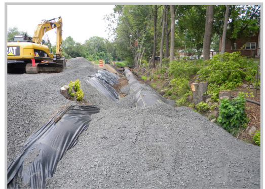
Installation of the temporary culvert pipe in Coles Brook.